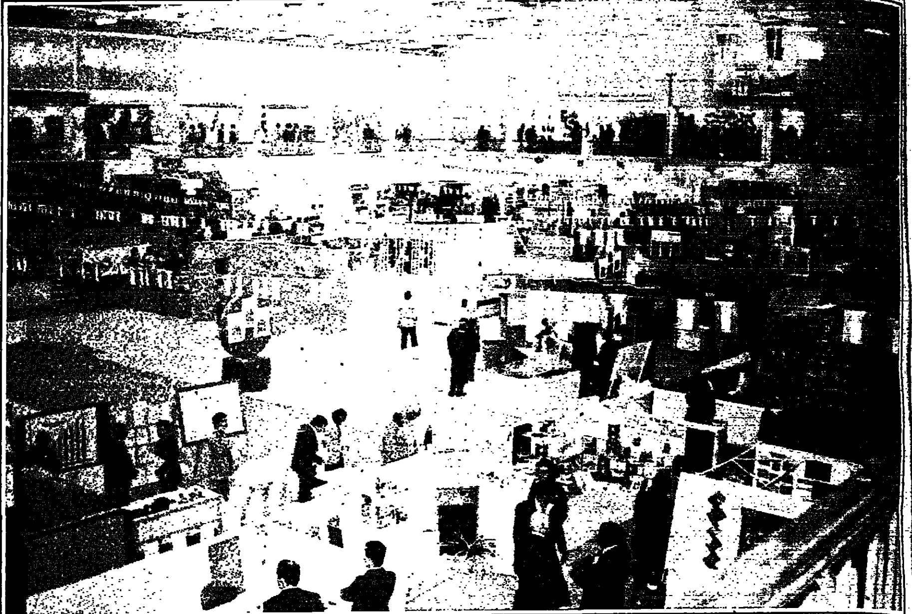
Some 70,000-80,000 industrialists, businessmen and merchants attended the Jordan industrial fair at Yarmouk University's gymnasium.